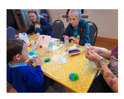
Making sun catchers showing our planet.