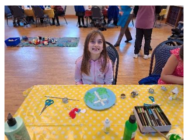
Hand printing and decorating our world.