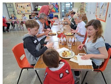
Having our Jubilee meal