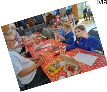
Making Spin Drums

“Do not forget to do good to others and share with them what you have. These are the things that please God.” Hebrews 13:16