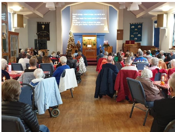
Christingle Service – it was brilliant to see so many people attend.