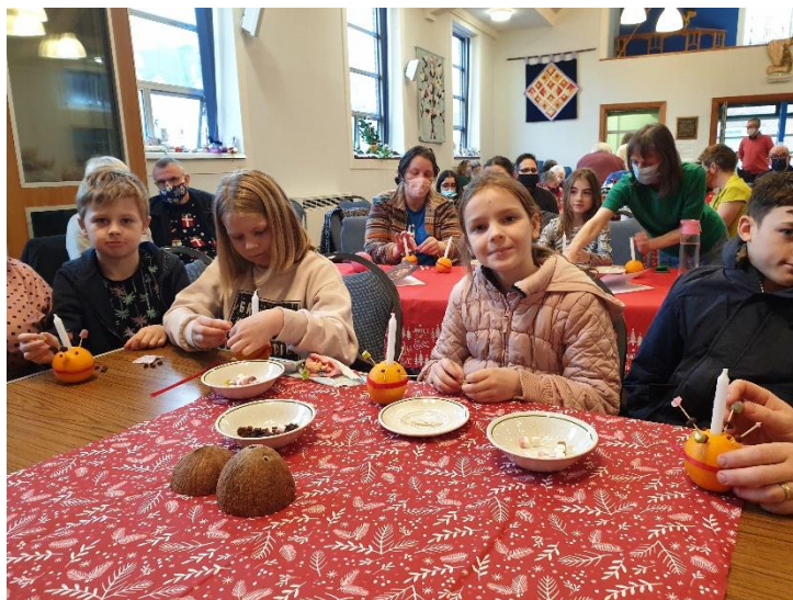
Brownies and Messy Church children putting together their Christingles.