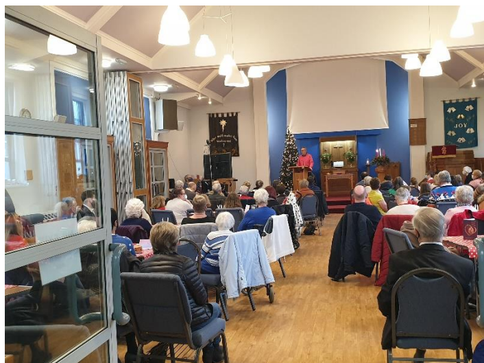
Relaxing listening to a Bible reading.