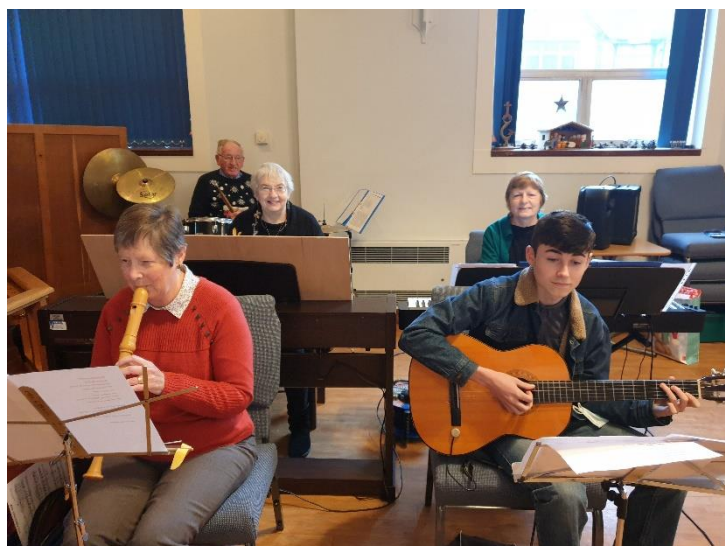
The Fareham Methodist Church band. Great music