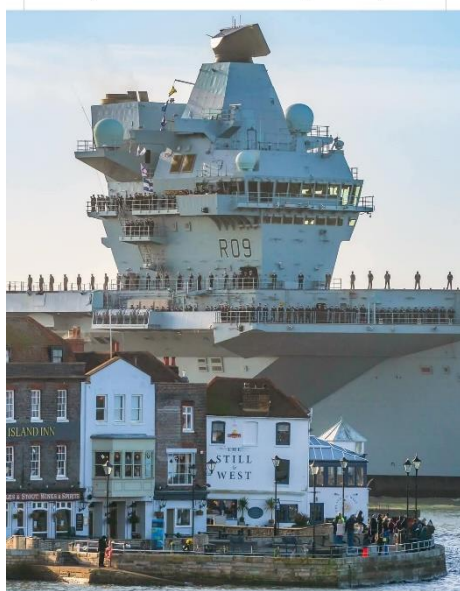
HMS Prince of Wales The Still And West, Old Portsmouth Royal Navy

HAPPY NEW YEAR – DEADLINE FOR FEBRUARY EFOCUS – 29 TH JANUARY