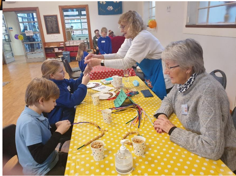
Making hearts with cheerios cereal or with beads. The cheerios were eaten so became the favourite activity.