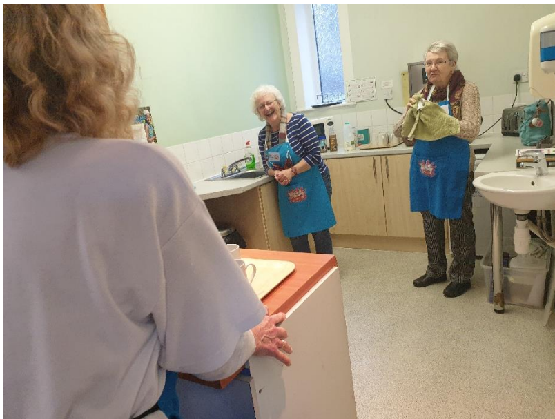
Having fun making the tea/coffee a very important way of giving love.