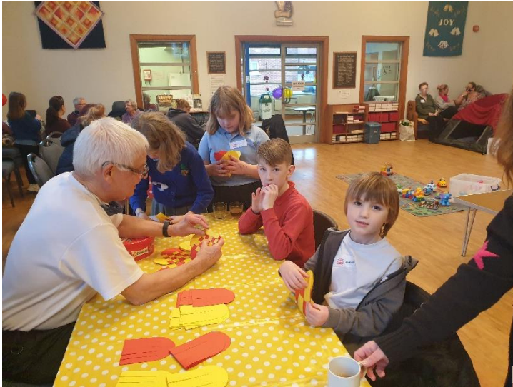
Weaving hearts in various ways once again showing love.