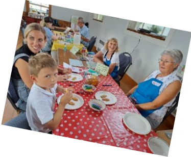
Decorating gingerbread to look like Zacchaeus

Jesus stopped at his tree and said, "Zacchaeus, come down immediately, I must stay at your house today." Jesus stayed with Zacchaeus for a meal.