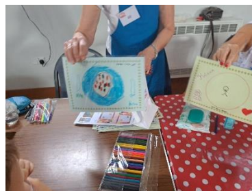
Colouring a placemat for our plate at dinner