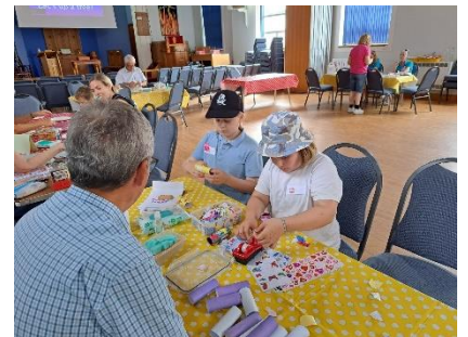
Making a pair of binoculars