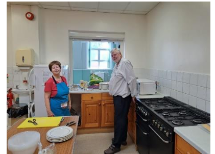
Chefs preparing dinner Yum. Yum