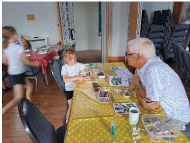
Zacchaeus climbing a tree