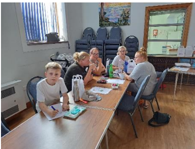
Colouring a picture of Zacchaeus