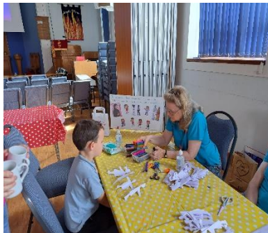
Making an All-Inclusive people paper chain