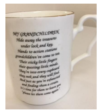
Mary's lockdown discovery